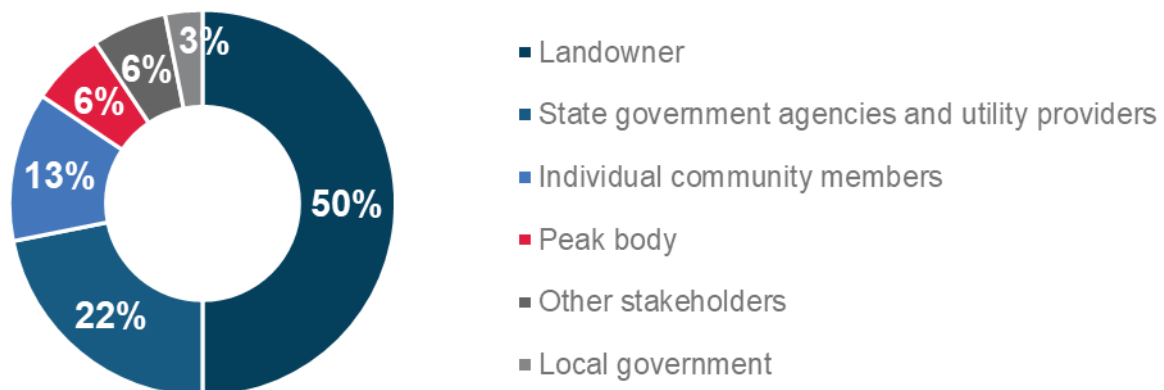
Figure 1: Submissions by stakeholder type