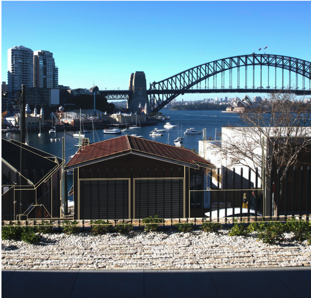
8 BAY VIEW ST - EXISTING VIEW 1M BACK FROM GLAZING LINE AS SURVEYED CAMERA HEIGHT RL 24.18, 1500mm ABOVE FFL