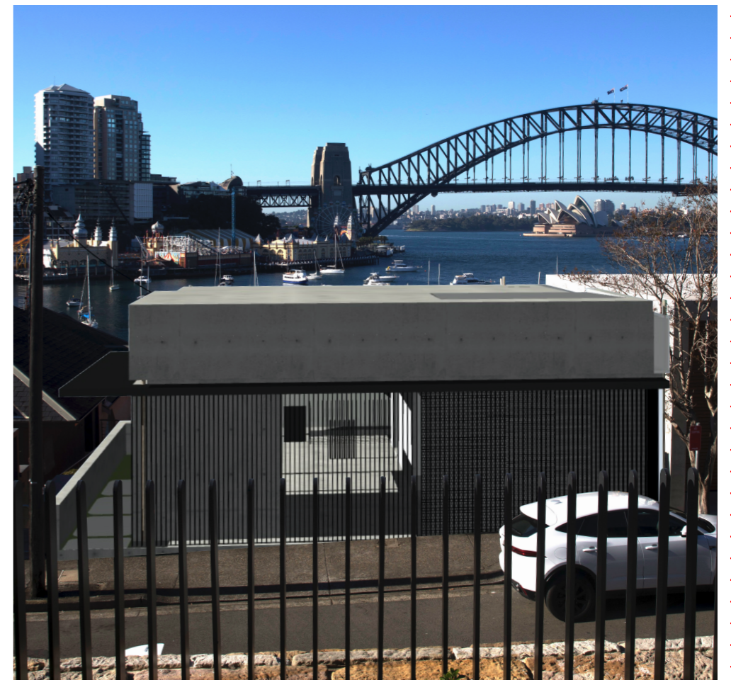
8 BAY VIEW ST - PROPOSED RENDERED VIEW 1M BACK FROM TERRACE EDGE AS SURVEYED CAMERA HEIGHT RL 24.18, 1500mm ABOVE FFL

CAMERA DETAILS Canon 5D Mark 4 Lens Canon EF 28 - 70mm f2.8 L 11 USM Focal length 28mm Camera height 1500mm