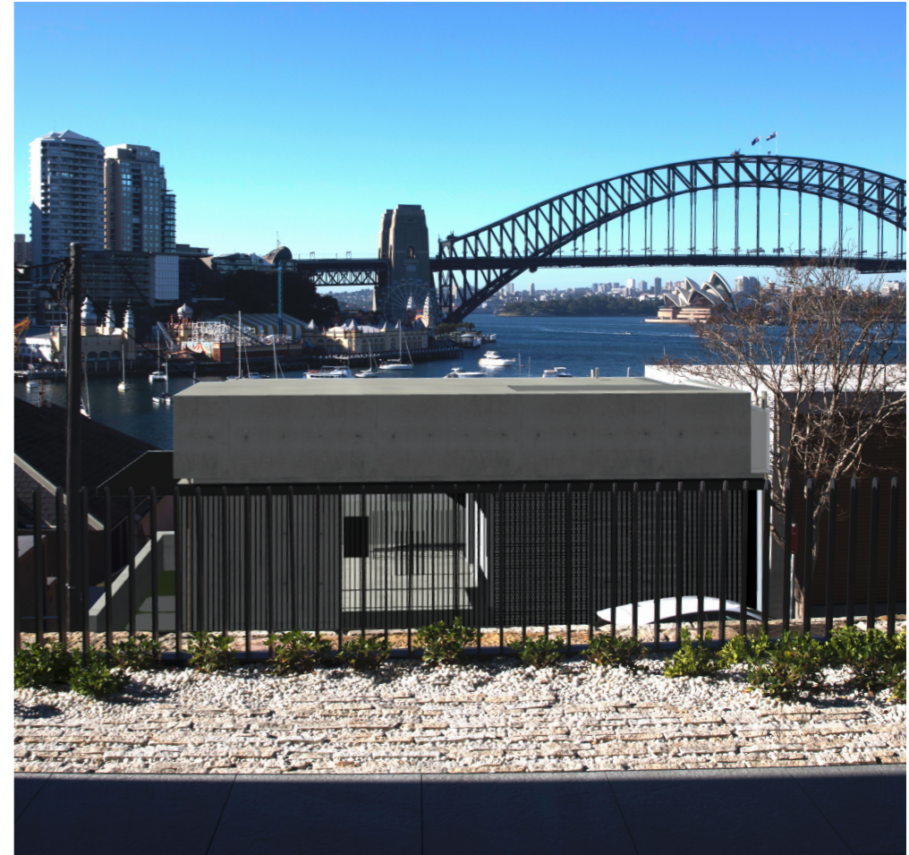
8 BAY VIEW ST - PROPOSED RENDERED VIEW 1M BACK FROM GLAZING LINE AS SURVEYED CAMERA HEIGHT RL 24.18, 1500mm ABOVE FFL

CAMERA DETAILS Canon 5D Mark 4 Lens Canon EF 28 - 70mm f2.8 L 11 USM Focal length 28mm Camera height 1500mm