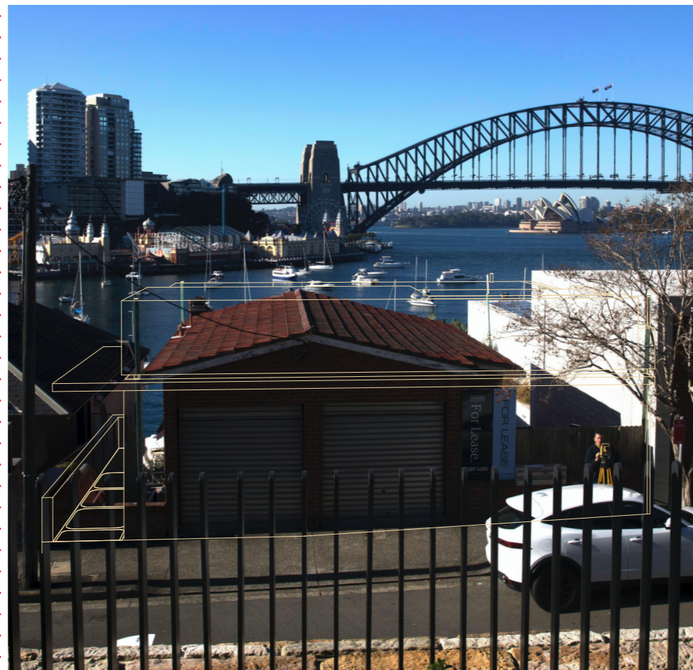
8 BAY VIEW ST - PROPOSED WIRE FRAME VIEW 1M BACK FROM TERRACE EDGE AS SURVEYED CAMERA HEIGHT RL 24.18, 1500mm ABOVE FFL