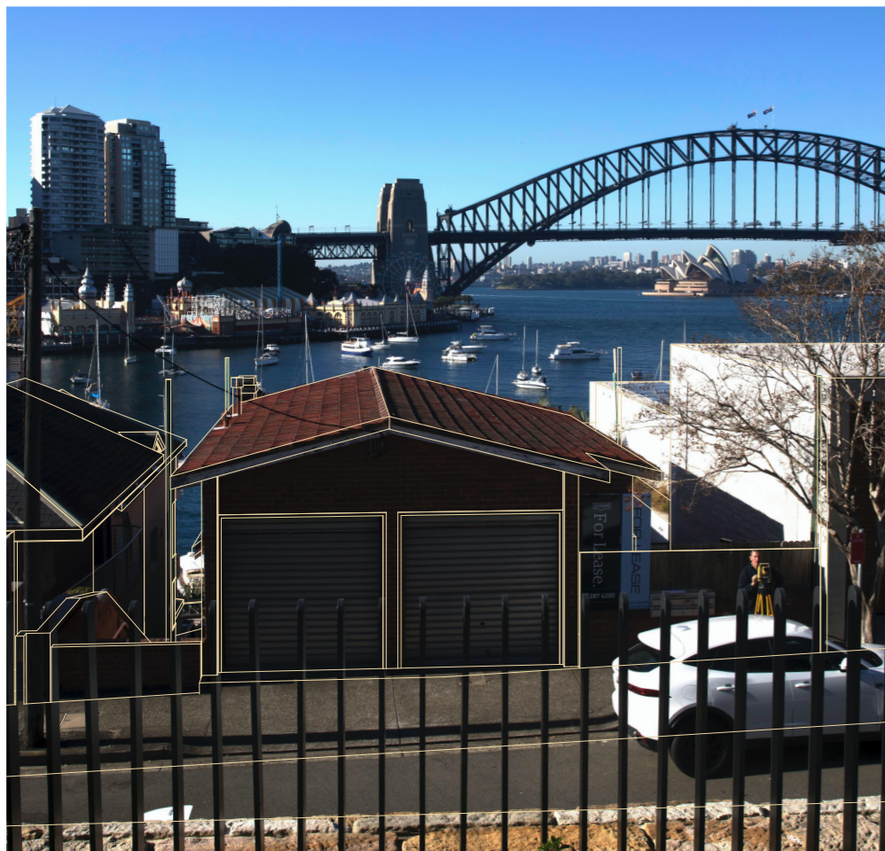
8 BAY VIEW ST - EXISTING VIEW 1M BACK FROM TERRACE EDGE AS SURVEYED CAMERA HEIGHT RL 24.18, 1500mm ABOVE FFL