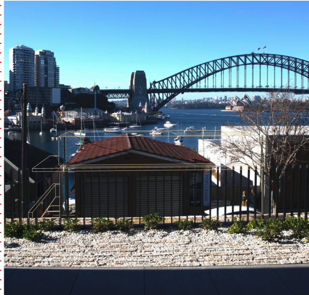
8 BAY VIEW ST - PROPOSED WIRE FRAME VIEW 1M BACK FROM GLAZING LINE AS SURVEYED CAMERA HEIGHT RL 24.18, 1500mm ABOVE FFL