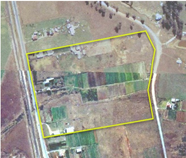
Photograph 2. 1977 Aerial

All parts of the land were inspected and no Aboriginal objects were identified on the property. No archaeologically sensitive areas occur on the land based on its landform and disturbance.