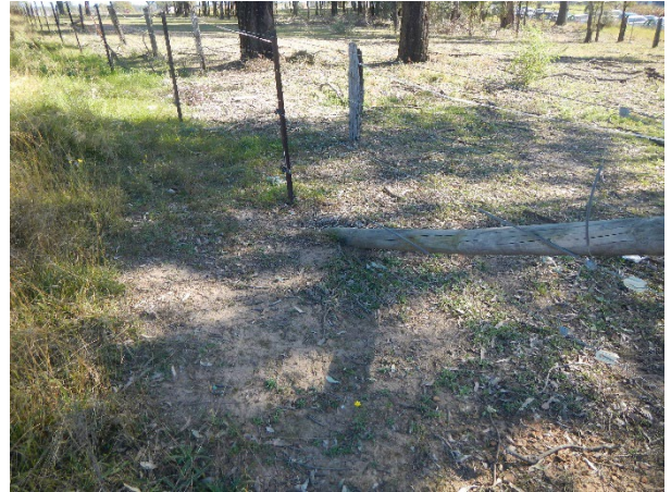
Photograph 5. Exposures at north east corner fence (July 2017)