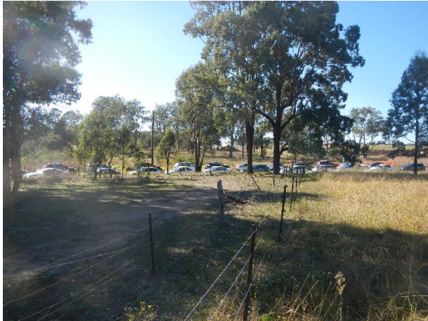
Photograph 4. View north east in vicinity of 45-5-4562 (July 2017)