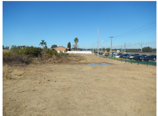
Photograph 7. View south over pipeline construction near Railway Terrace (July 2017)