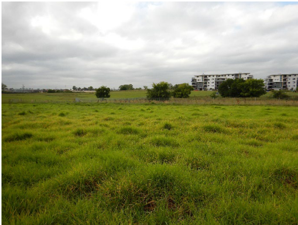
Photograph 8. View south over grassed land (Feb 2023)