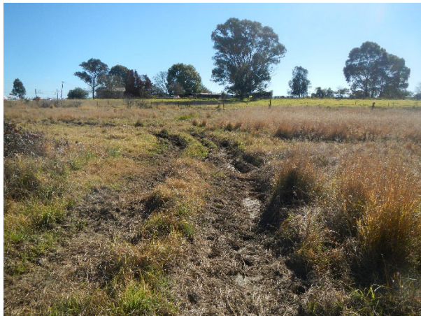
Photograph 6. View north over tracks near farm dam (July 2017)