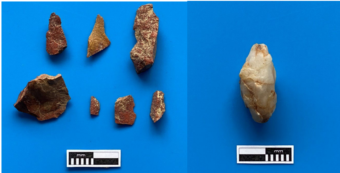
Photograph 1. Typical Aboriginal Stone Artefacts from the Cumberland Plain (Badgerys Creek)

While there are many other types of Aboriginal sites, the question of whether stone artefact sites or scarred trees occur on the land is the primary focus of this due diligence assessment.