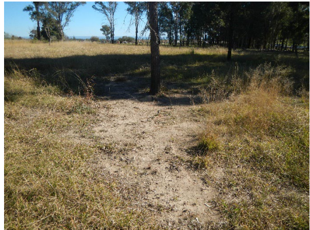
Photograph 3. North east corner view north over exposure near site 45-5-4562 (July 2017)

Source: https://maps.blacktown.nsw.gov.au/ accessed 21 February 2023