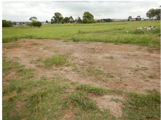
Photograph 9. Track ground exposure (Feb 2023)