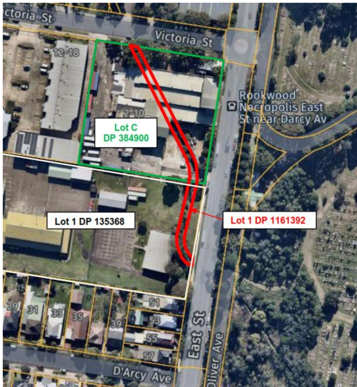
Figure 1: The site in its local context

The site is located to the south of Lidcombe Town Centre as shown by Figure 2 : Surrounding land uses include:-