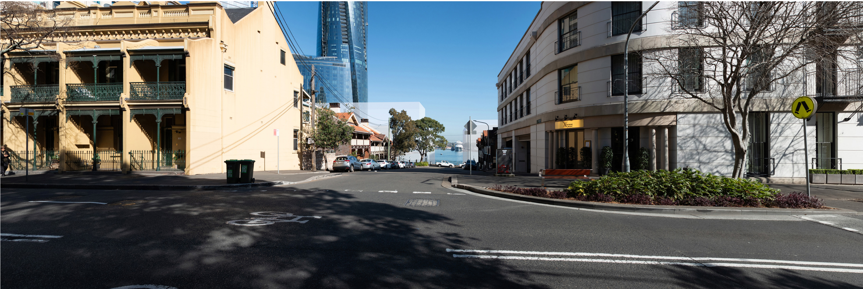
Figure 8 Visualisation showing the development envelope of the Proposed MOD9 RtS development envelope (AECOM, May 2024)