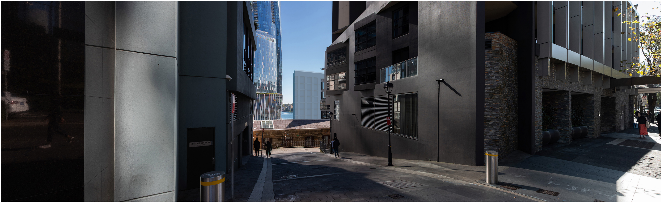
Figure 13 Visualisation showing the development envelope of the Proposed MOD9 RtS development envelope and the RtS Reference Design (AECOM, May 2024)