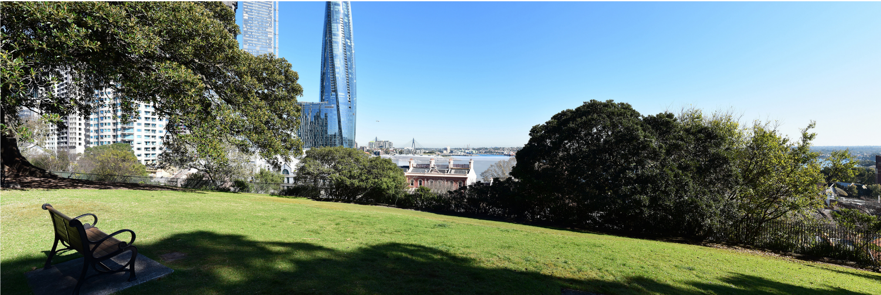
Figure 4 Visualisation showing the development envelope of the Proposed MOD9 RtS development envelope (AECOM, May 2024)