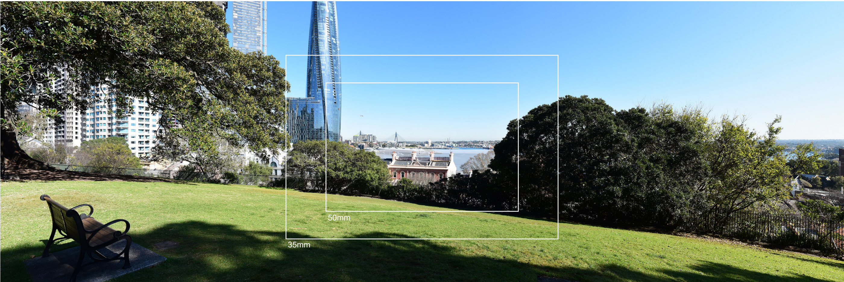
Figure 2 Visualisation showing the development envelope of the Approved Concept Plan (AECOM, May 2024)

The visual assessment of the Observer Location 2 can be found in section 6.2 of the VVIA (2023).