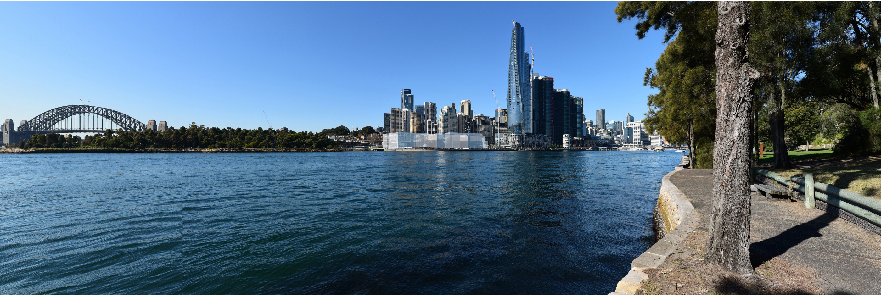
Figure 16 Visualisation showing the development envelope of the Proposed MOD9 RtS development envelope (AECOM, May 2024)