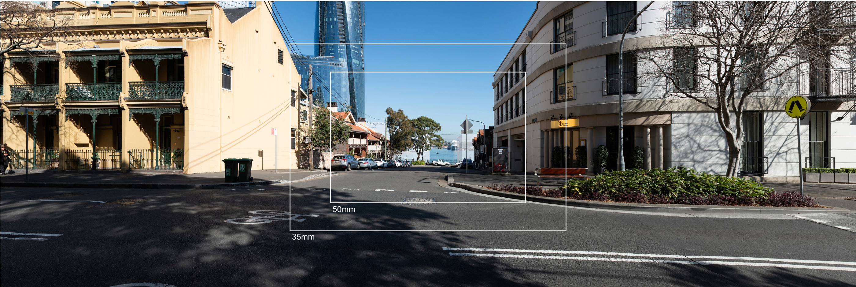
Figure 6 Visualisation showing the development envelope of the Approved Concept Plan (AECOM, May 2024)

The visual assessment of the Observer Location 3 can be found in section 6.3 of the VVIA (2023).