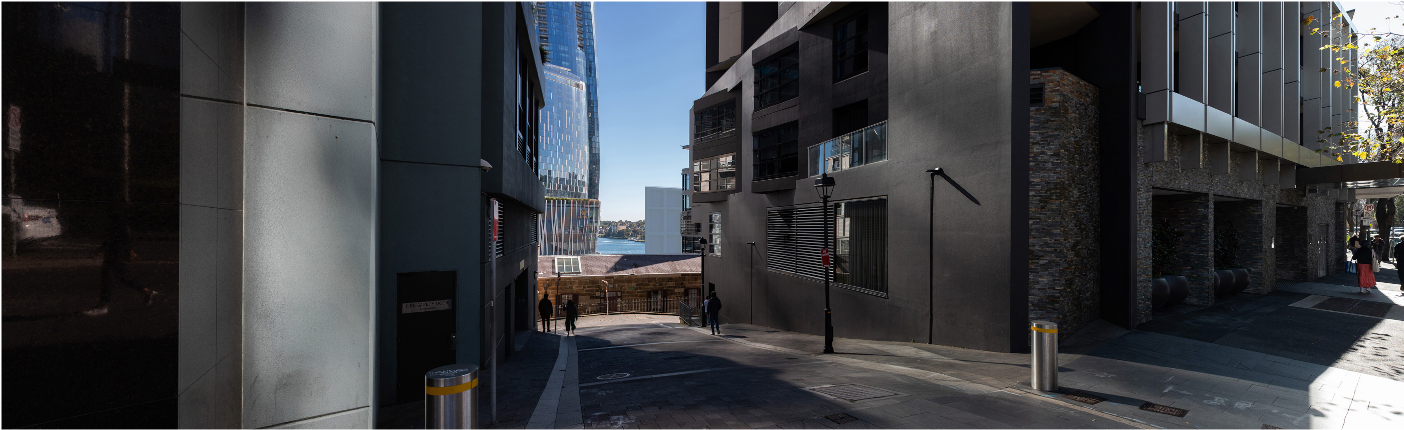
Figure 11 Visualisation showing the development envelope of the Approved Concept Plan and the Indicative Massing (AECOM, May 2024)