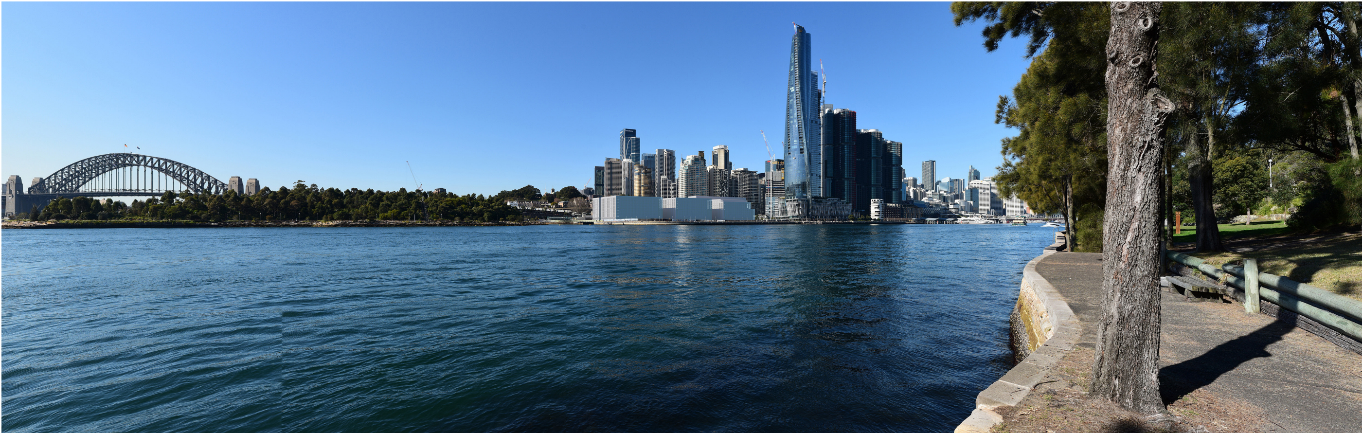
Figure 17 Visualisation showing the development envelope of the Proposed MOD9 RtS development envelope and the RtS Reference Design (AECOM, May 2024)