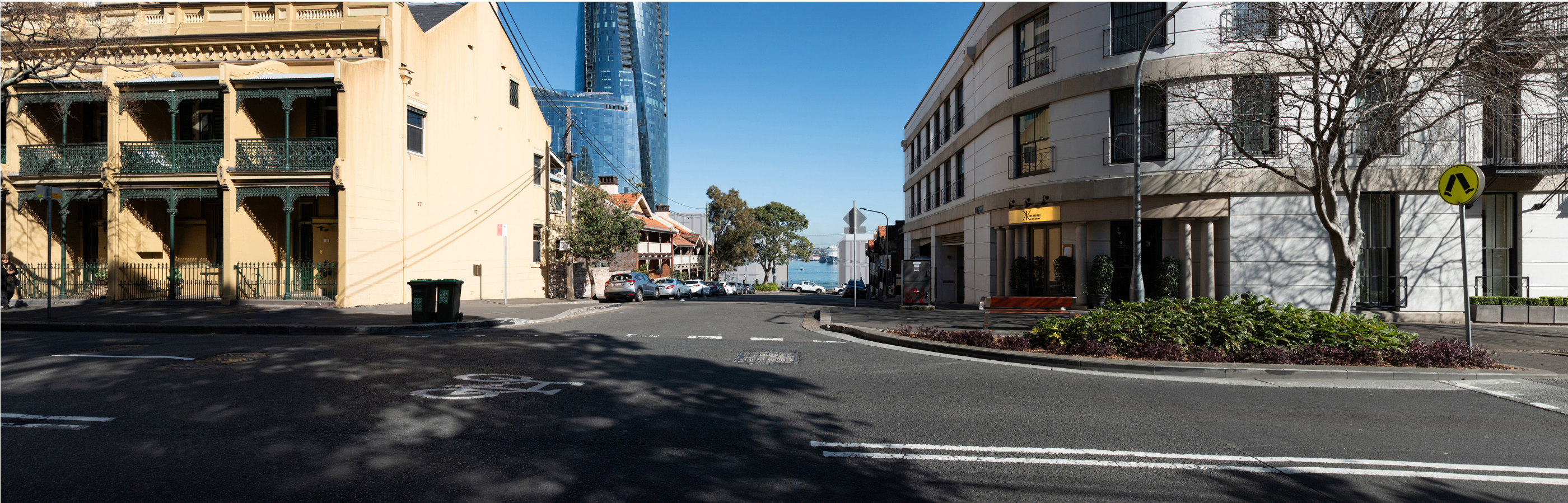
Figure 7 Visualisation showing the development envelope of the Approved Concept Plan and the Indicative Massing (AECOM, May 2024)