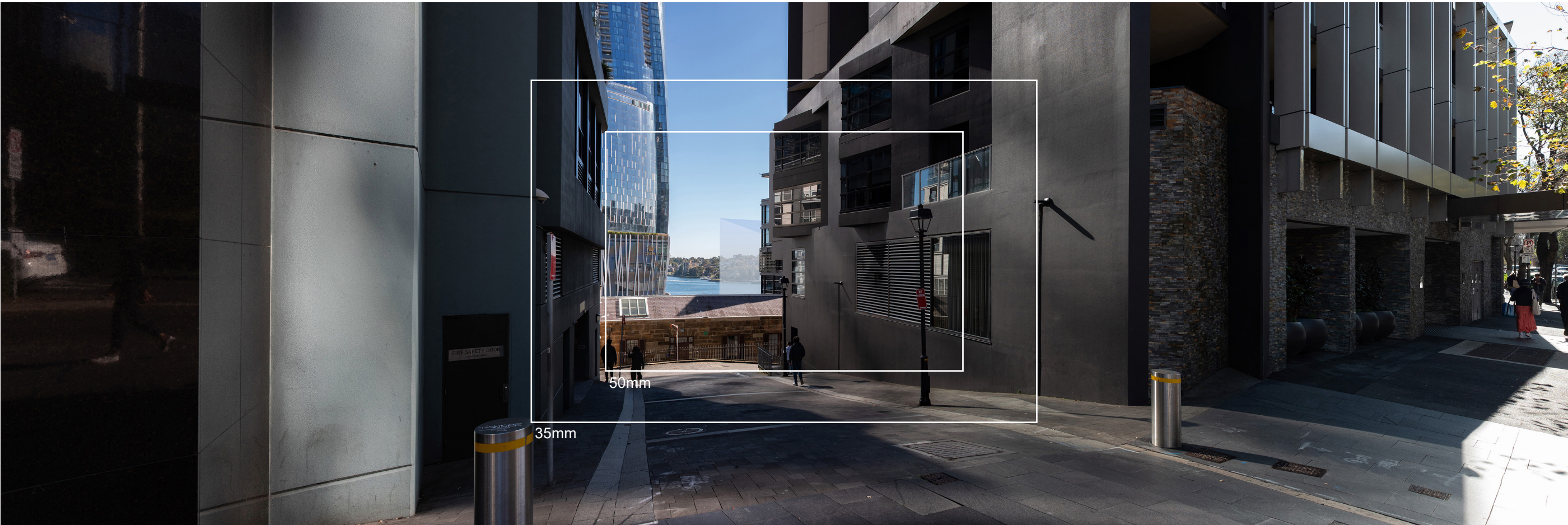
Figure 10 Visualisation showing the development envelope of the Approved Concept Plan (AECOM, May 2024)

The visual assessment of the Observer Location 9 can be found in section 6.9 of the VVIA (2023).