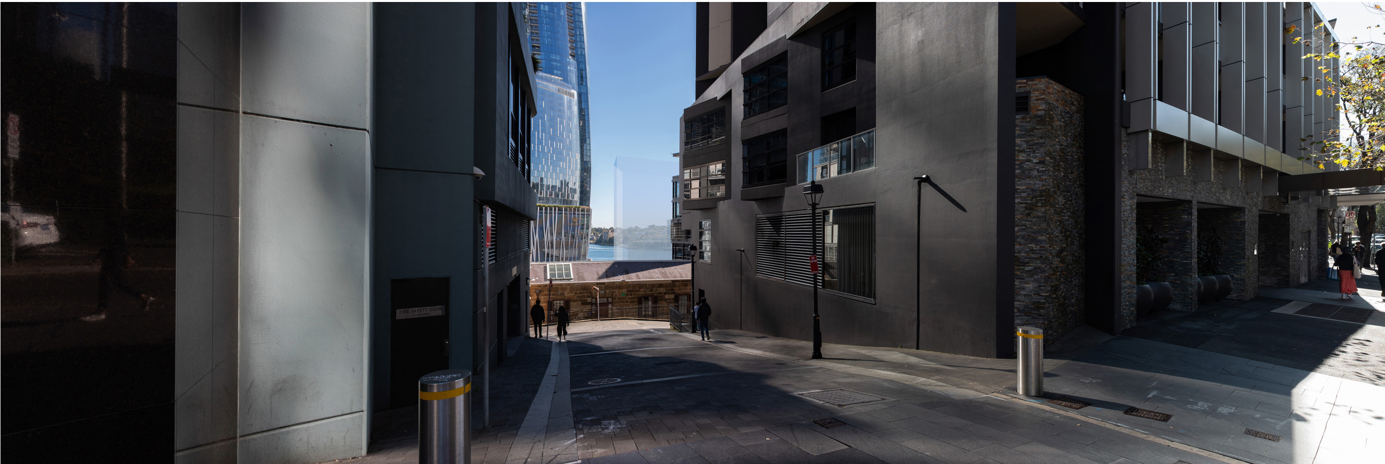
Figure 12 Visualisation showing the development envelope of the Proposed MOD9 RtS development envelope (AECOM, May 2024)