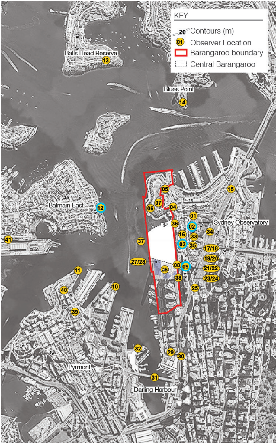
Figure 1 Map of Observer Locations (OL's) assessed in the VVIA (2023)

Figure 1 shows the observer locations assessed in the VVIA (2023), with those considered in this addendum VVIA (2024) outlined in blue.