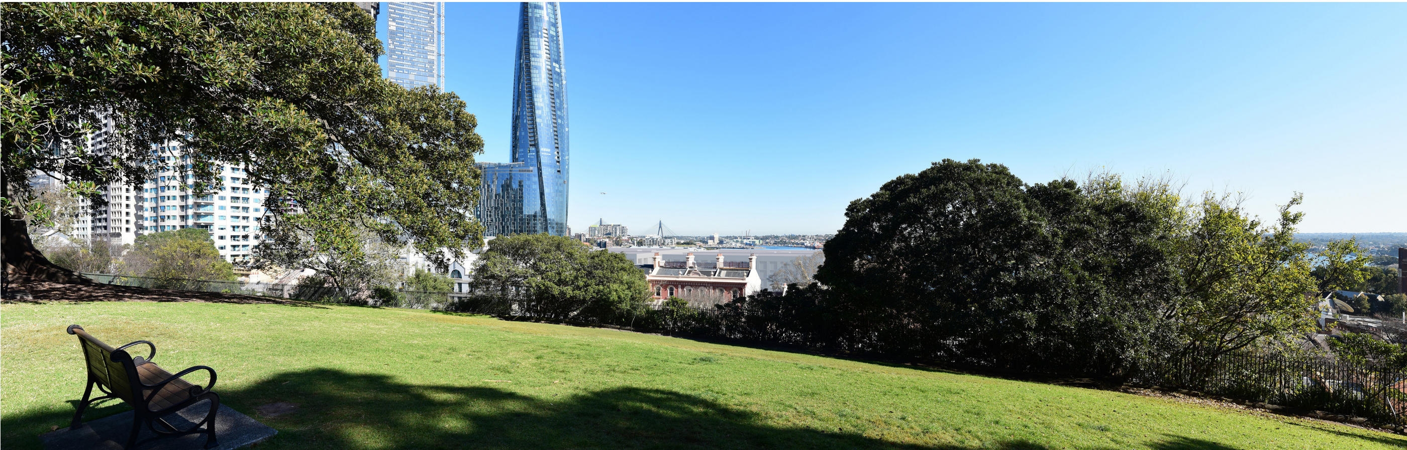
Figure 5 Visualisation showing the development envelope of the Proposed MOD9 RtS development envelope and the RtS Reference Design (AECOM, May 2024)