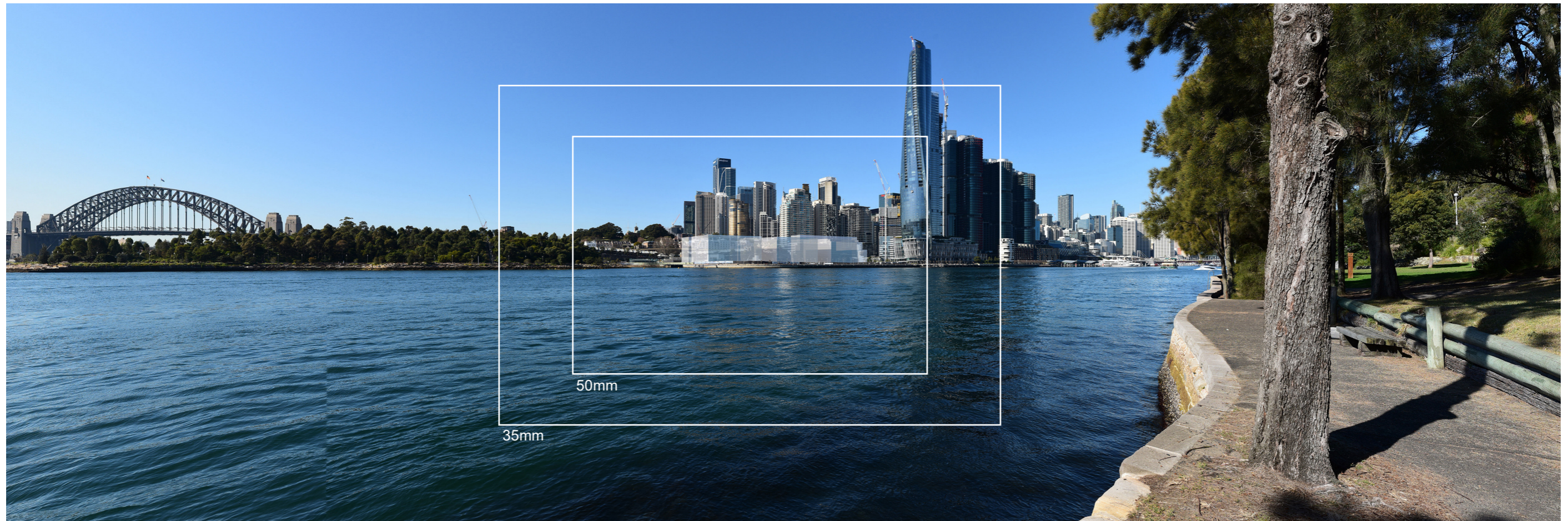
Figure 16 Visualisation showing the development envelope of the Proposed MOD9 RtS development envelope (AECOM, May 2024)