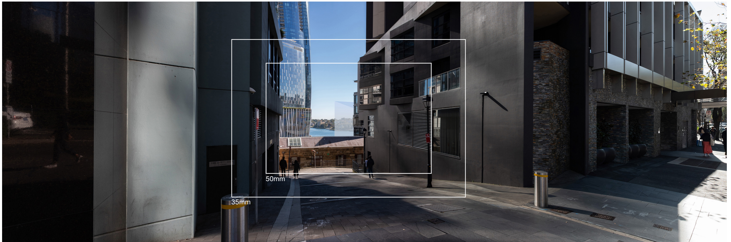
Figure 10 Visualisation showing the development envelope of the Approved Concept Plan (AECOM, May 2024)

The visual assessment of the Observer Location 9 can be found in section 6.9 of the VVIA (2023).