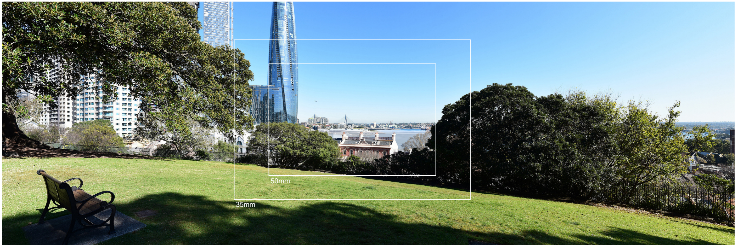
Figure 4 Visualisation showing the development envelope of the Proposed MOD9 RtS development envelope (AECOM, May 2024)