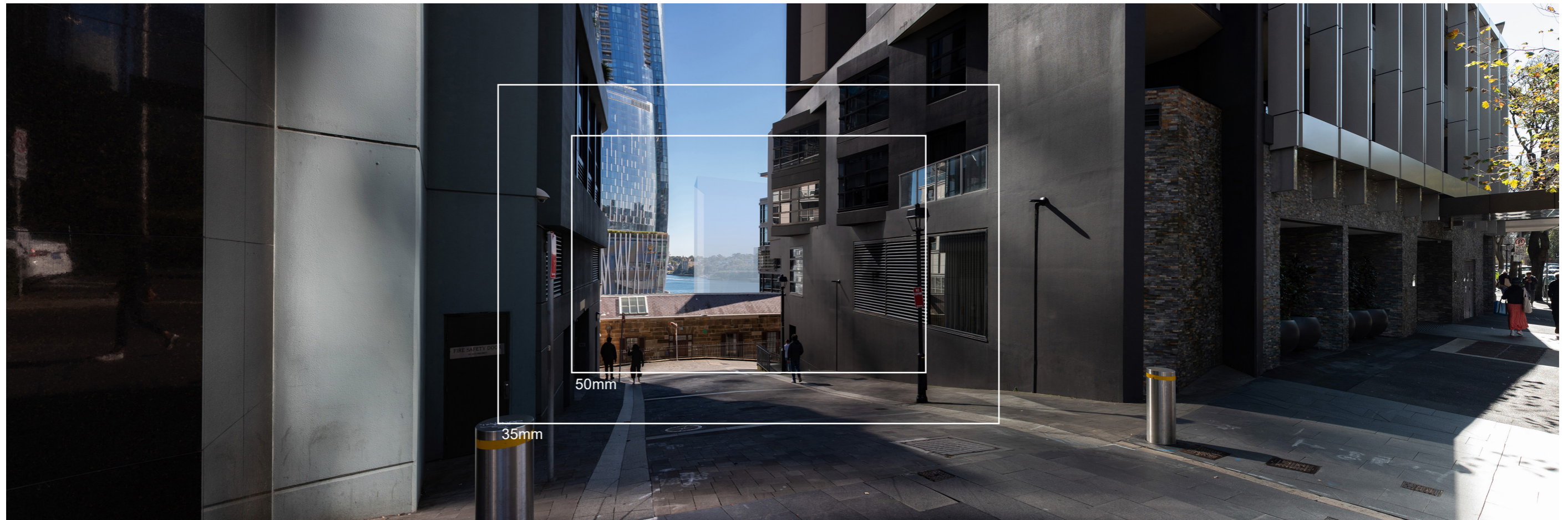
Figure 12 Visualisation showing the development envelope of the Proposed MOD9 RtS development envelope (AECOM, May 2024)