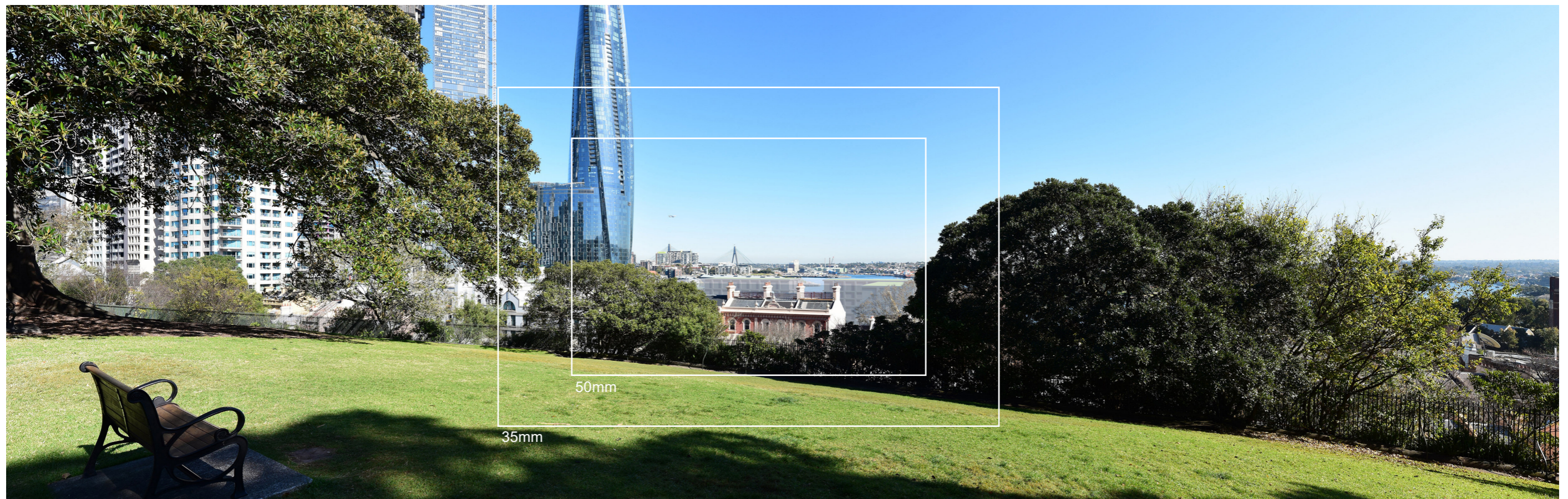
Figure 3 Visualisation showing the development envelope of the Approved Concept Plan and the Indicative Massing (AECOM, May 2024)