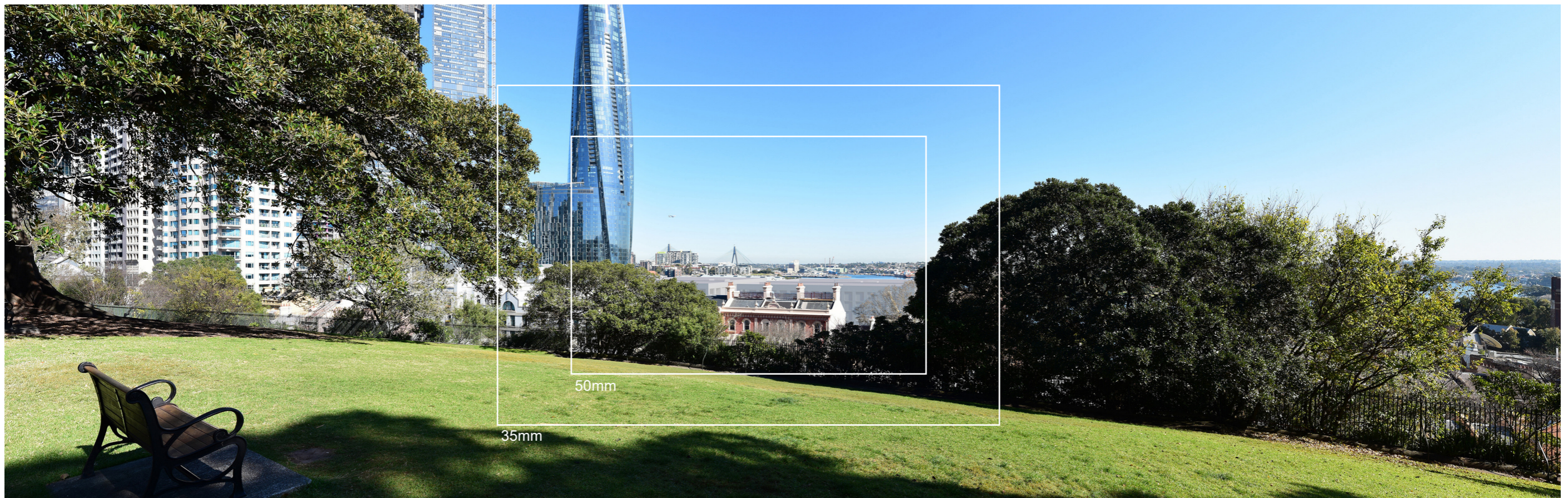
Figure 5 Visualisation showing the development envelope of the Proposed MOD9 RtS development envelope and the RtS Reference Design (AECOM, May 2024)