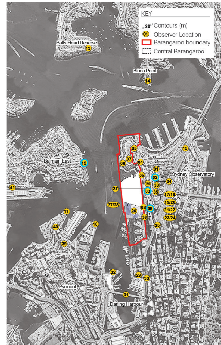
Figure 1 Map of Observer Locations (OL's) assessed in the VVIA (2023)

Figure 1 shows the observer locations assessed in the VVIA (2023), with those considered in this addendum VVIA (2024) outlined in blue.