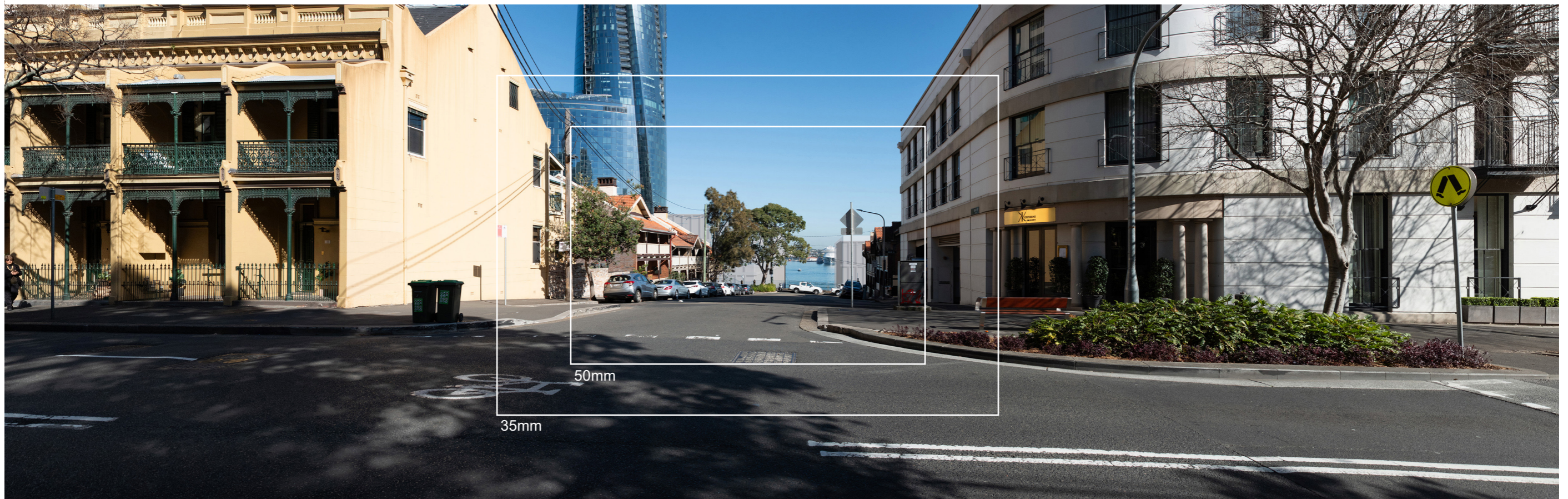
Figure 7 Visualisation showing the development envelope of the Approved Concept Plan and the Indicative Massing (AECOM, May 2024)