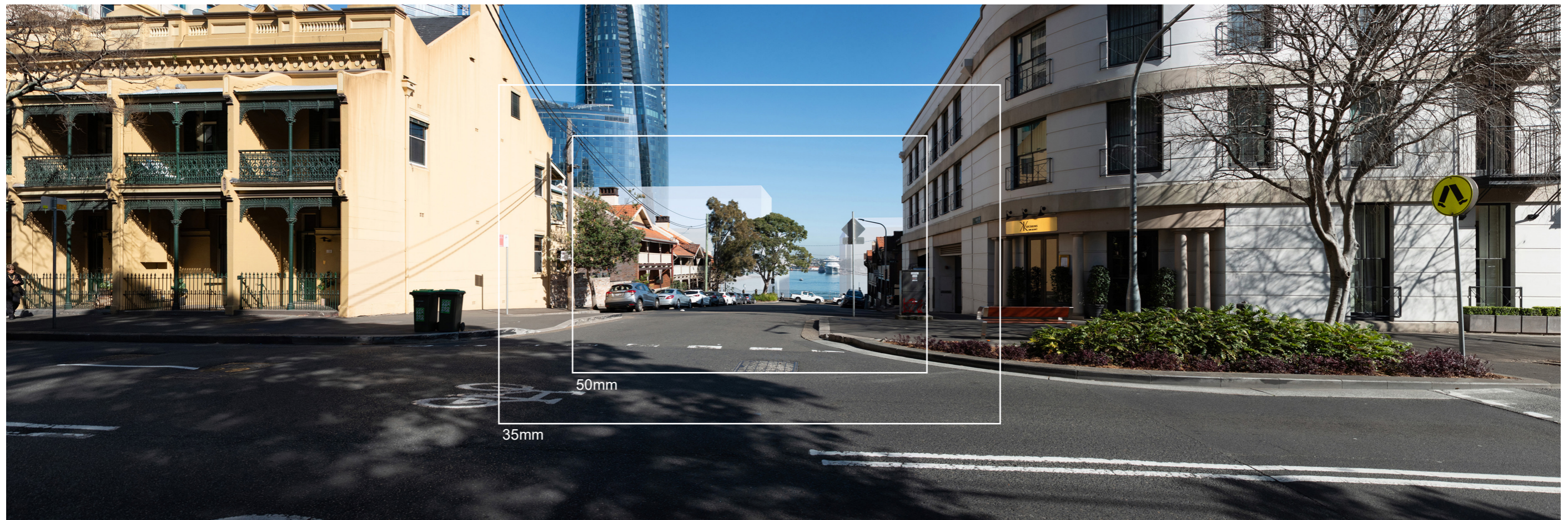
Figure 8 Visualisation showing the development envelope of the Proposed MOD9 RtS development envelope (AECOM, May 2024)