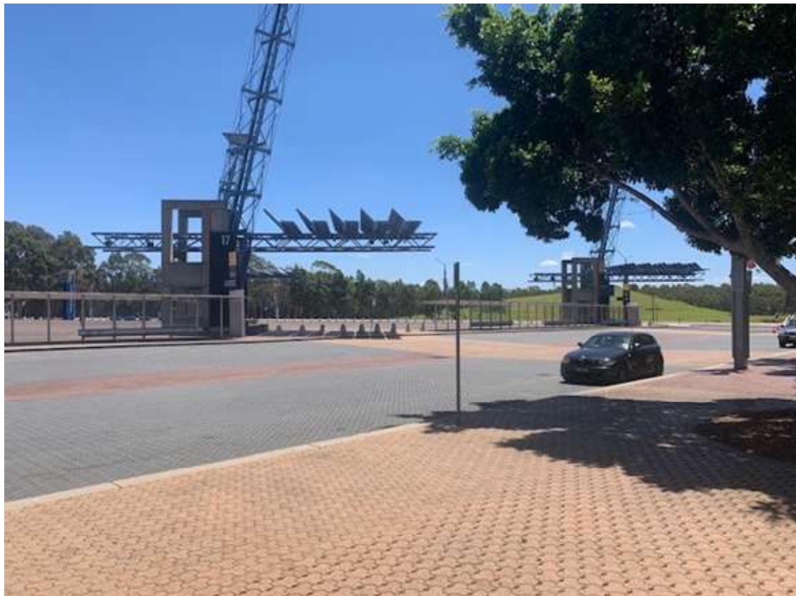
Image 3 – looking west towards the site from Olympic Boulevard. Lighting pylons in the mid-ground with Haslams Creek in the background.