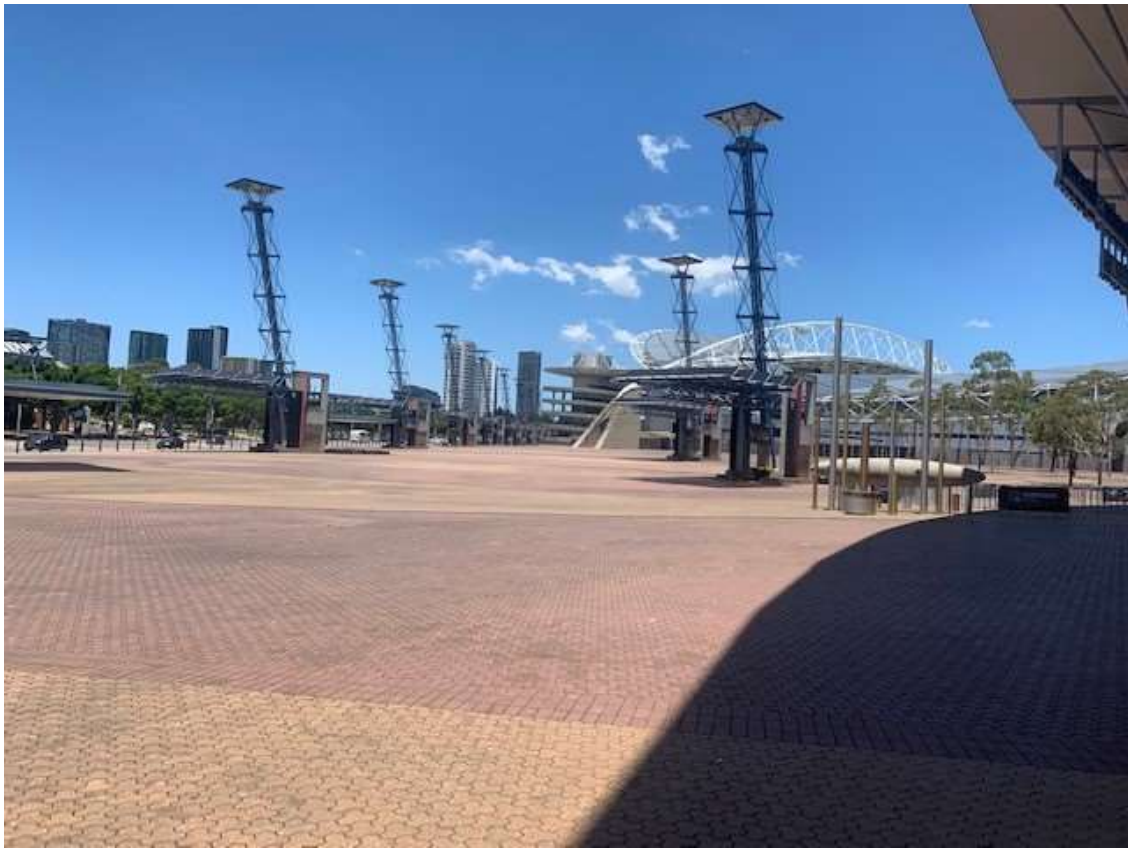
Image 2 – looking south from Qudos Bank Arena towards Sydney Olympic Park town centre. With public art in the mid-ground and Stadium Australia in the background.