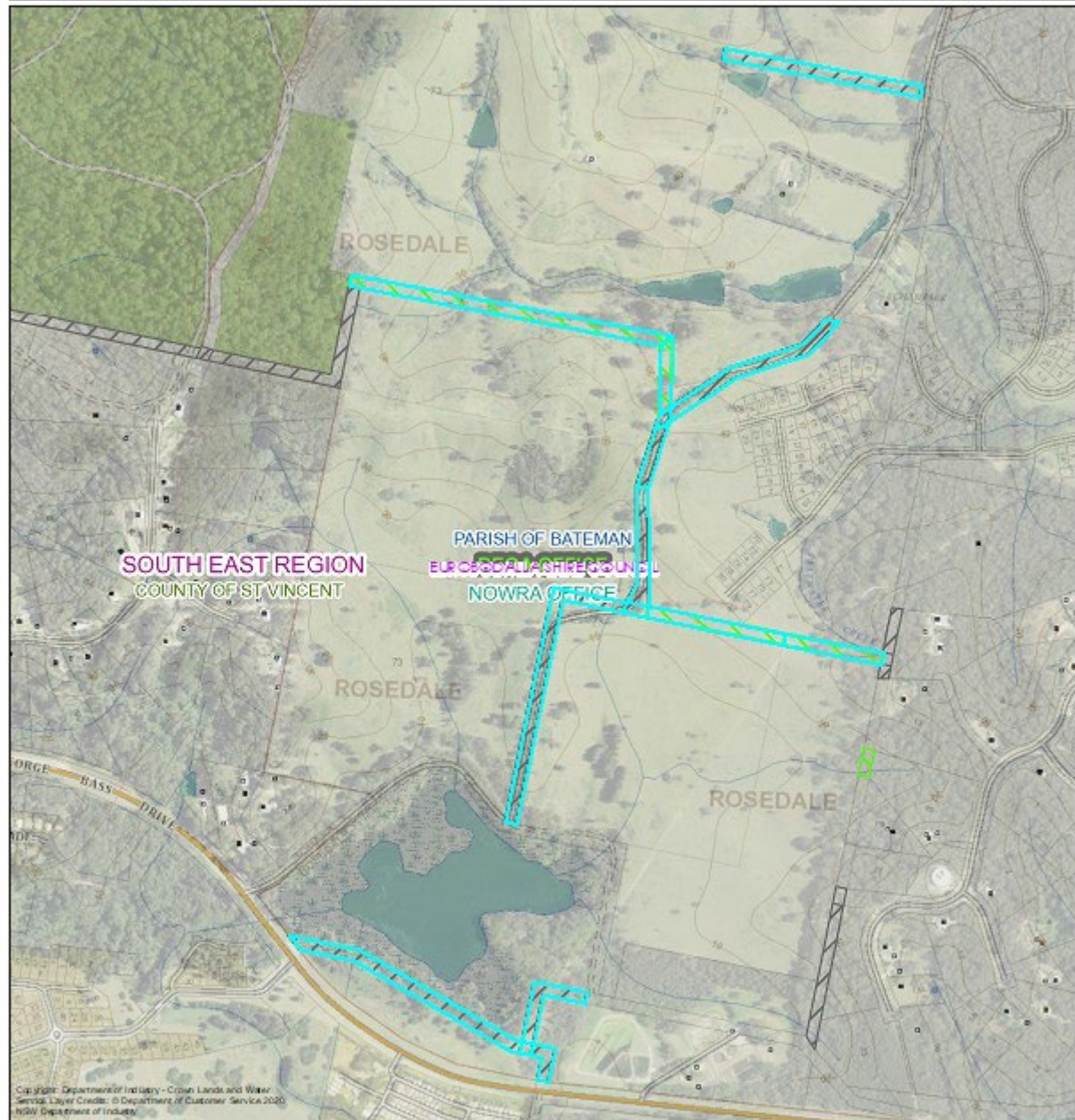
Diagram 1 – Location