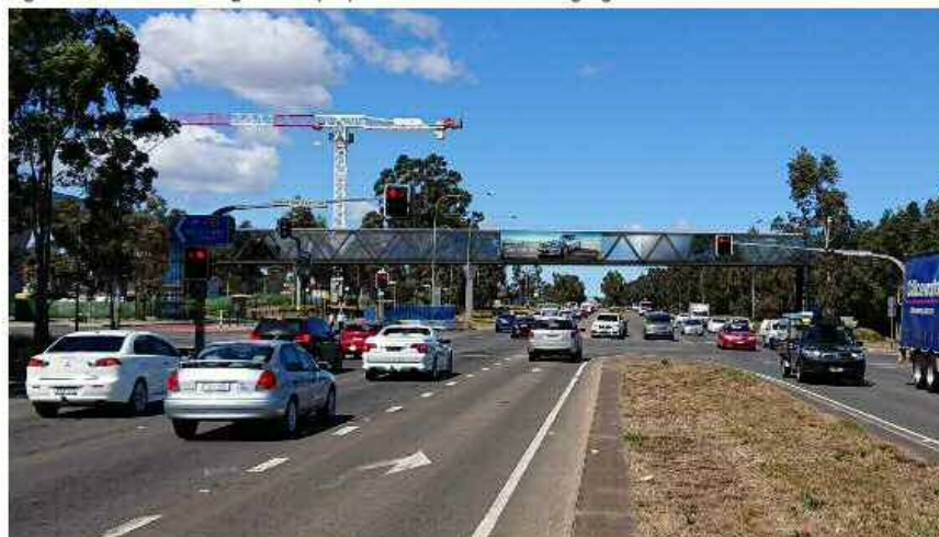
Figure 2.3: Photomontage of the proposed southbound facing sign