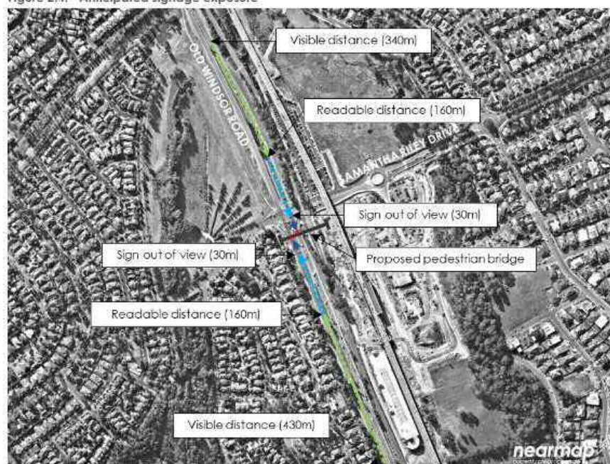
Figure 2.4: Anticipated signage exposure

A driver's view of the northbound and southbound facing signs from their respective readable distances are shown in Figure 2.5 and Figure 2.6, respectively.