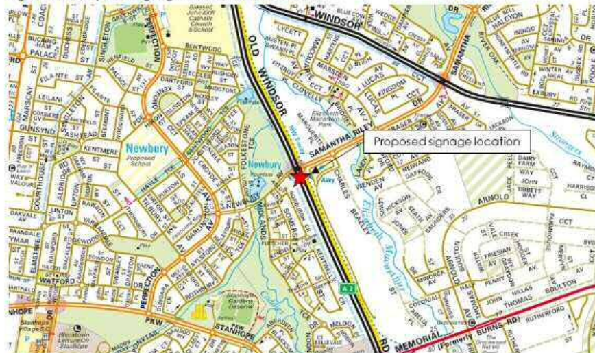
Figure 2.1: Proposed signage location and surrounds

The proposed signage location and the surrounding environs are shown in Figure 2.1.