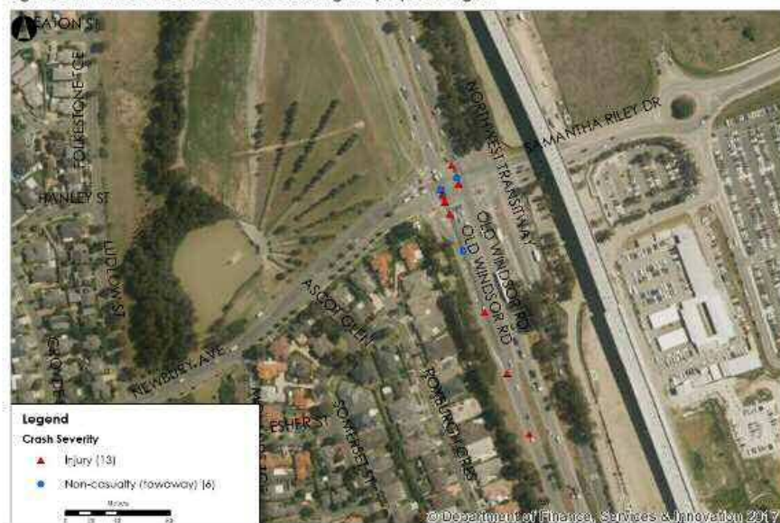
Figure 2.7: Relevant crash data surrounding the proposed signs

Figure 2.7 indicates that there is a cluster of crashes at the Old Windsor Road/ Newbury Avenue/ Samantha Riley Drive intersection. Closer analysis indicates there have been 15 crashes at this intersection, with 10 of these crashes (67%) classified as rear-end crashes which are typical in busy urban environments where congestion is common. Two of the crashes (11%) were classified as adjacent crashes while the remaining three crashes were unclassified.