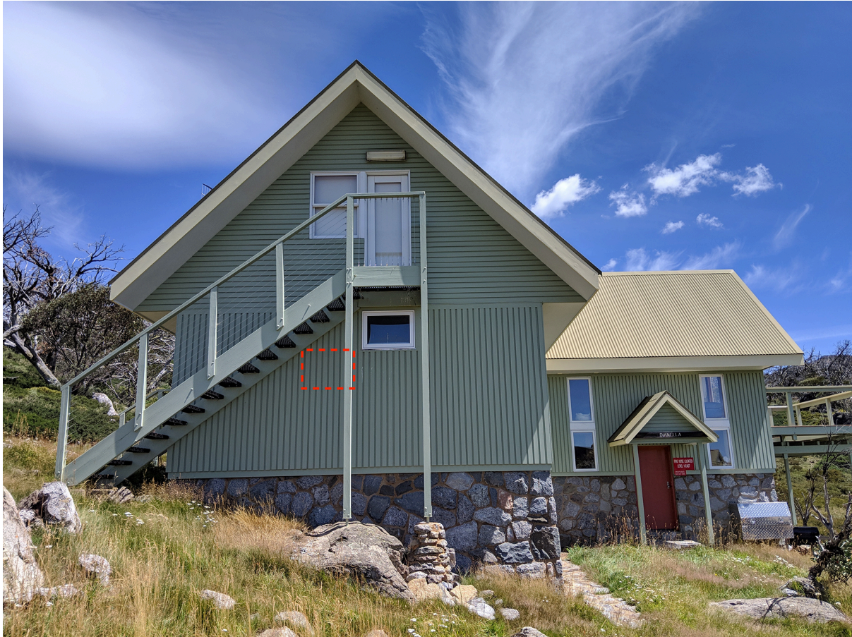
Photograph showing East elevation of Dianella - works limited to new window shown dashed and making good of cladding

No physical erosion or sediment controls are proposed as works are mostly limited to internal carpentry and fit out. External works are limited to the removal of one window, installation of one window in new location and making good of timber cladding on the East elevation.