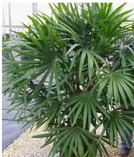
Rhapis excelsa Lady Palm