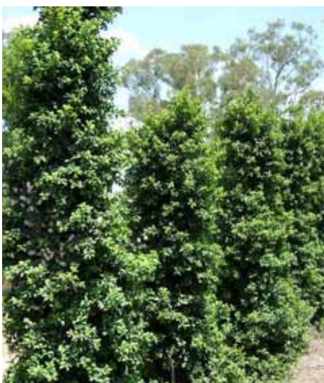
Syzygium 'Straight and Narrow' Lilli Pilli