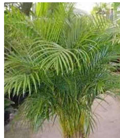
Chamaedorea seifrizii Bamboo Palm