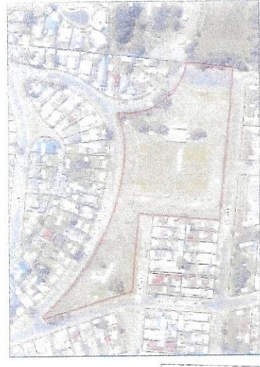
LOCATION PLAN N.T.S.